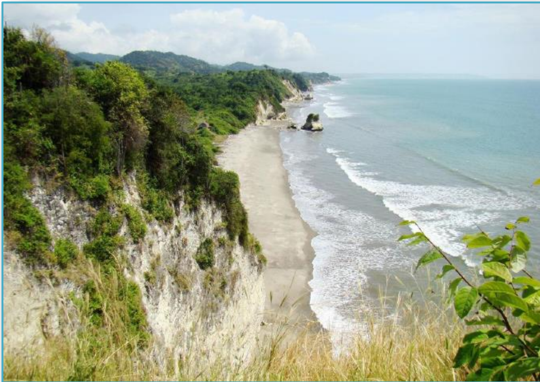
The Pacific Coastline in Jama County, Manabí, Ecuador